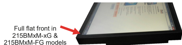
Full flat front in 215BMxM-xG & 215BMxM-FG models